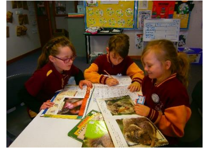
Students working in a cooperative group investigating the Koalas life cycle.

In term 2 the year 2/3's have been learning about Life Cycle's . Within Science, students investigated how living things grow, change and have offspring similar to themselves. They are using inquiry skills to research the changes and patterns of various animals such as Scorpions, Koalas, Pandas, Lions and Snow Leopards.